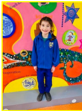
Deputy Prime Minister Alice – Year 2